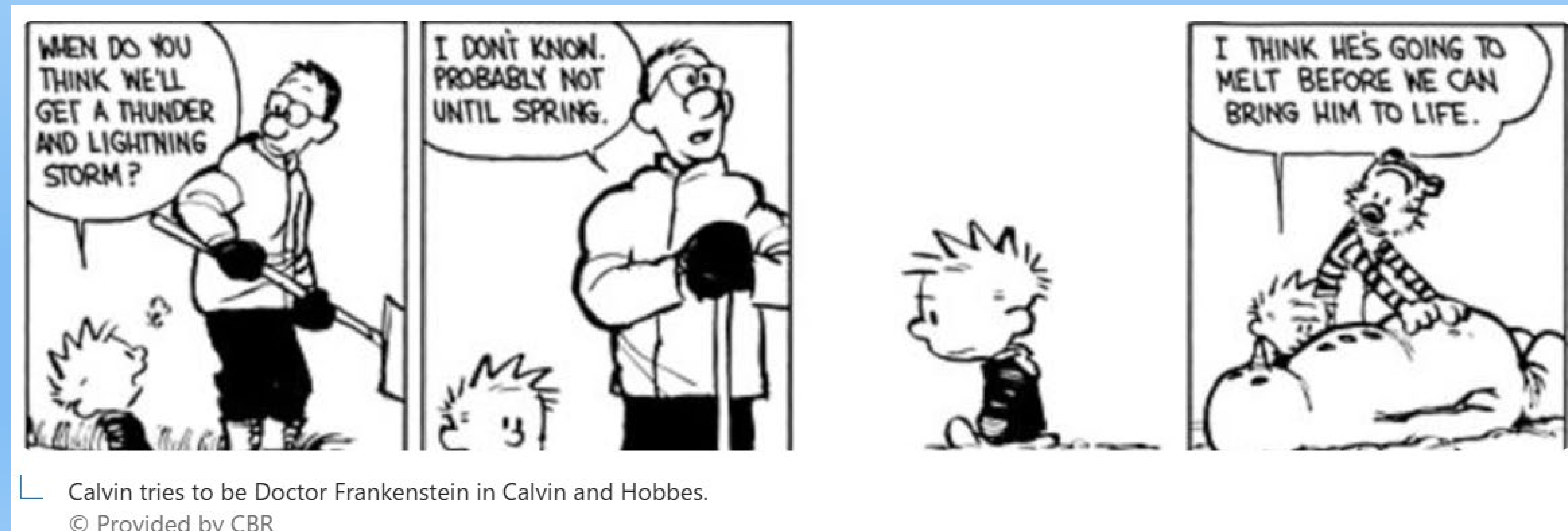
Calvin tries to be Doctor Frankenstein in Calvin and Hobbes.